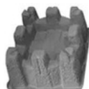
Upper insert tray